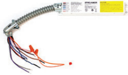
emergency driver - p83