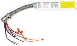
emergency driver - p83