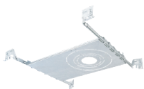
MRSDMP-346 Mounting plate for 3"/4"/6" can-less downlight