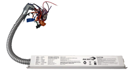
Emergency Backup 8W/18W/32W