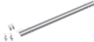
MLAS-RM-KIT 2'4' Recessed Mount Kit