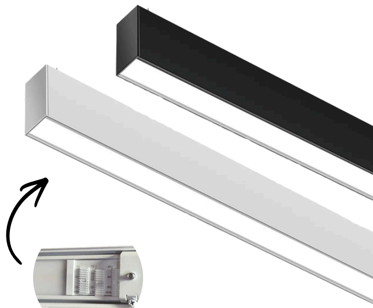
Color and Wattage and Light Selectable