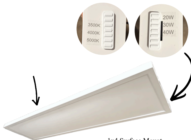
1x4 Surface Mount

This 1x4 surface mount panel is designed for easy ceiling installation without recessed housing requirements. Featuring field-selectable wattage and color temperature , it delivers flexible lighting performance for commercial and residential applications. Ideal for offices, hallways, retail spaces, classrooms, and other indoor environments requiring efficient and uniform illumination.